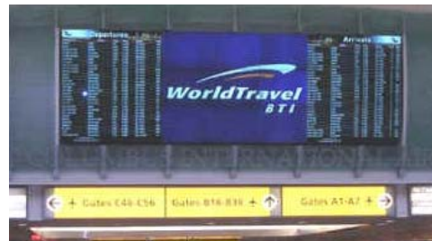
Columbus International Airport