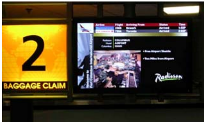
Columbus International Airport